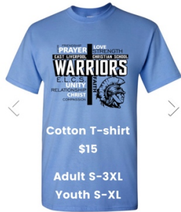
Cotton T-shirt $15 Adult S-3XL Youth S-XL