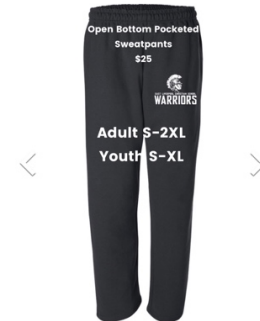
Open Bottom Pocketed Sweatpants $25 Adult S-2XL Youth S-XL