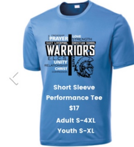
Short Sleeve Performance Tee $17 Adult S-4XL Youth S-XL

Aquatic Blue, Kelly Green, Athl Heather, Neon Pink