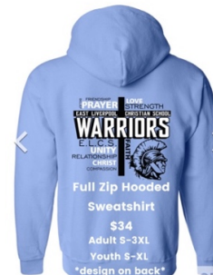
Full Zip Hooded Sweatshirt $34 Adult S-3XL Youth S-XL *design on back*