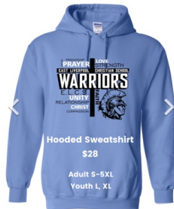
Hooded Sweatshirt $28 Adult S-5XL Youth L, XL