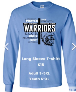
Long Sleeve T-shirt $18 Adult S-5XL Youth S-XL

Youth – Carolina Blue, Gold, Heliconia, Irish Green, Sport Grey