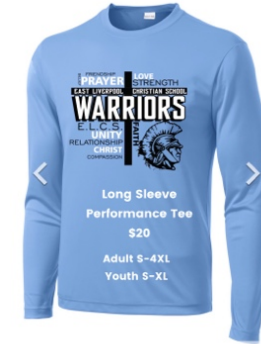
Long Sleeve Performance Tee $20 Adult S-4XL Youth S-XL

Carolina Blue, Gold, Kelly Green, Neon Pink, Silver